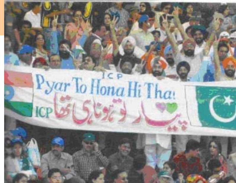
This photograph was taken in Lahore at the India/Pakistan match in 2004. The slogan translates as 'Love is inevitable'.

Reading a joint statement as he stood next to Musharraf, Singh said the two, "conscious of the historic opportunity created by the improved relations and the overwhelming desire of the peoples of the two countries for durable peace...determined that the peace process was now irreversible".