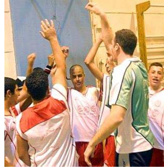
Playing For Peace has coached Israeli and Palestinian teenagers in the Middle East, and 12,000 10- to 14-year-old Catholic and Protestant children in integrated settings in Northern Ireland.

Lessons Learned: Sport can be an effective way to help people, ethnic groups, and nations confront stereotypes and assumptions and learn conflict resolution skills